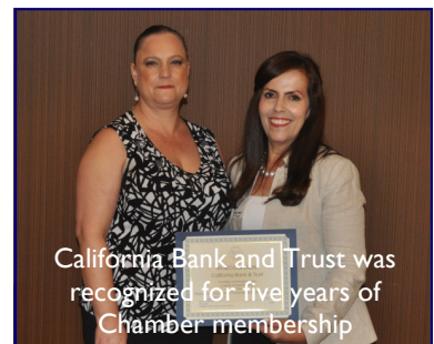
California Bank and Trust was recognized for five years of Chamber membership