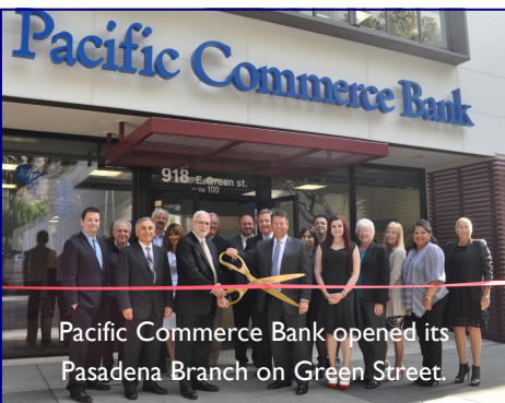
Pacific Commerce Bank opened its Pasadena Branch on Green Street.