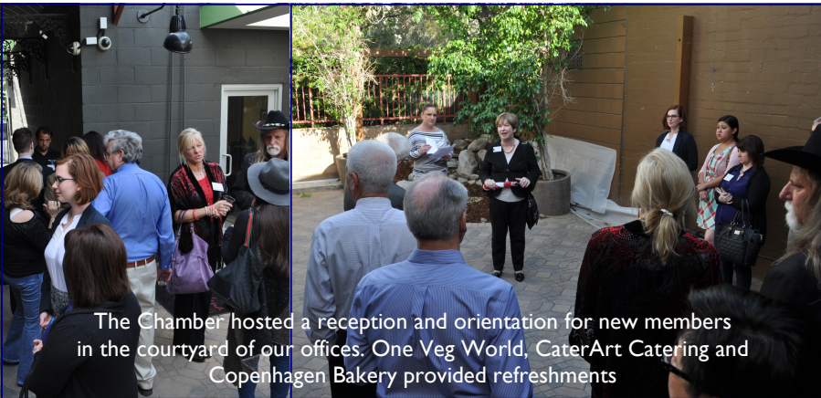
The Chamber hosted a reception and orientation for new members in the courtyard of our offices. One Veg World, CaterArt Catering and Copenhagen Bakery provided refreshments