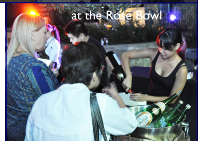
at the Rose Bowl