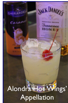
Alondra Hot Wings' Appellation

Advance tickets to the Taste of Pasadena are available for $30 each at www.pasadena-chamber.org/events/taste-pasadena-and-sip-tember-finale-rose-bowl-september-21-2016 . Tickets are $50 at the door. Only 500 tickets will be sold for the Taste of Pasadena.