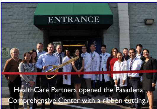
HealthCare Partners opened the Pasadena Comprehensive Center with a ribbon cutting.