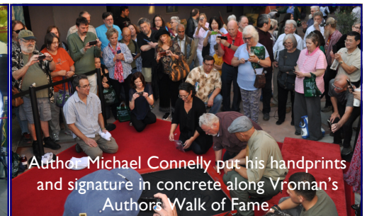
Author Michael Connelly put his handprints and signature in concrete along Vroman's Authors Walk of Fame.