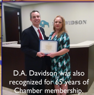
D.A. Davidson was also recognized for 65 years of Chamber membership.