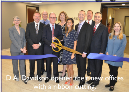
D.A. Davidson opened their new offices with a ribbon cutting.