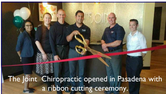
The Joint Chiropractic opened in Pasadena with a ribbon cutting ceremony.