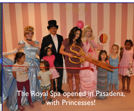
The Royal Spa opened in Pasadena, with Princesses!