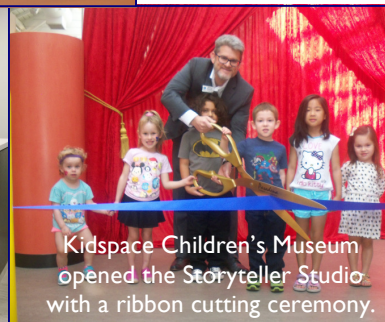
Kidspace Children's Museum opened the Storyteller Studio with a ribbon cutting ceremony.